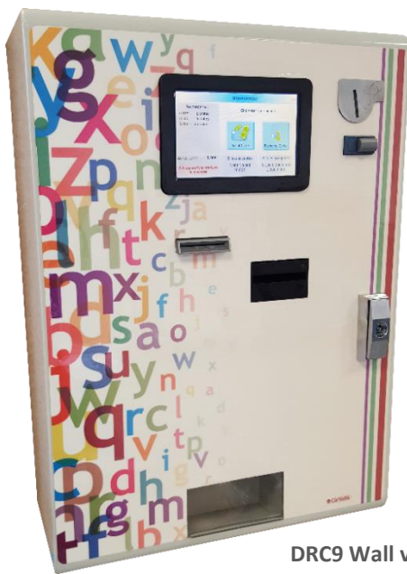
DRC9 Wall version

Autonomous dispenser / reloader of magnetic cards for the payment of copies and printings